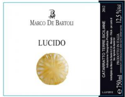
IGT Catarratto Terre Siciliana "Lucido"