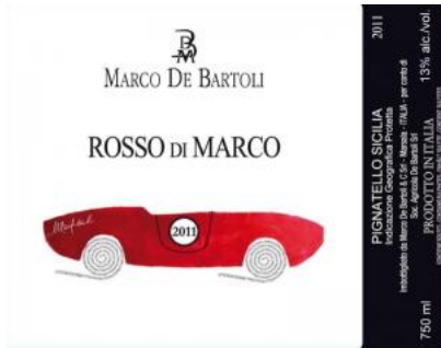
IGT Sicilia "Rosso di Marco"