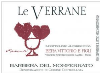
D.O.C Barbera del Monferrato "Le Verrane"