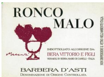
D.O.C Barbera D'Asti "Ronco Malo"