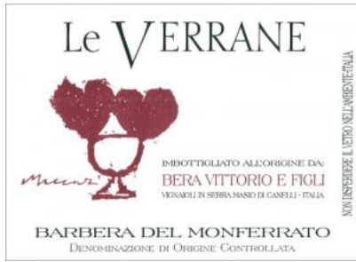
D.O.C Barbera del Monferrato "Le Verrane"