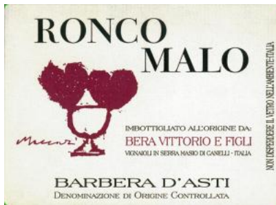
D.O.C Barbera D'Asti "Ronco Malo"