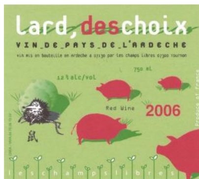
Vdp "Lard, des choix" Red