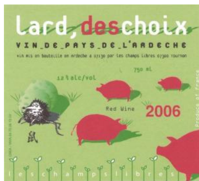
Vdp "Lard, des choix" Red