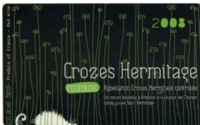
A.O.C Crozes-Hermitage "Foufoune"