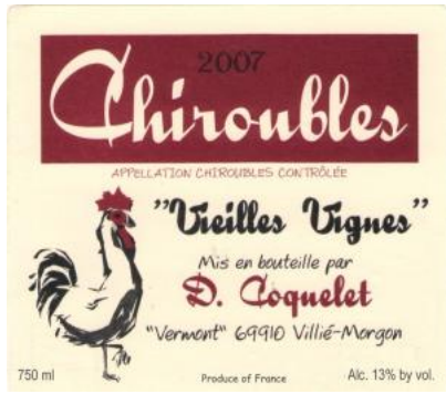
A.O.C Chiroubles "Vieilles Vignes"