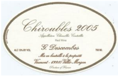
A.O.C Chiroubles "Vielles Vignes"