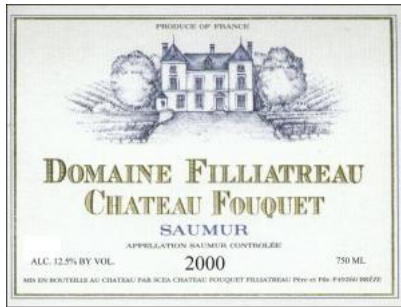
A.O.C Saumur "Château Fouquet"