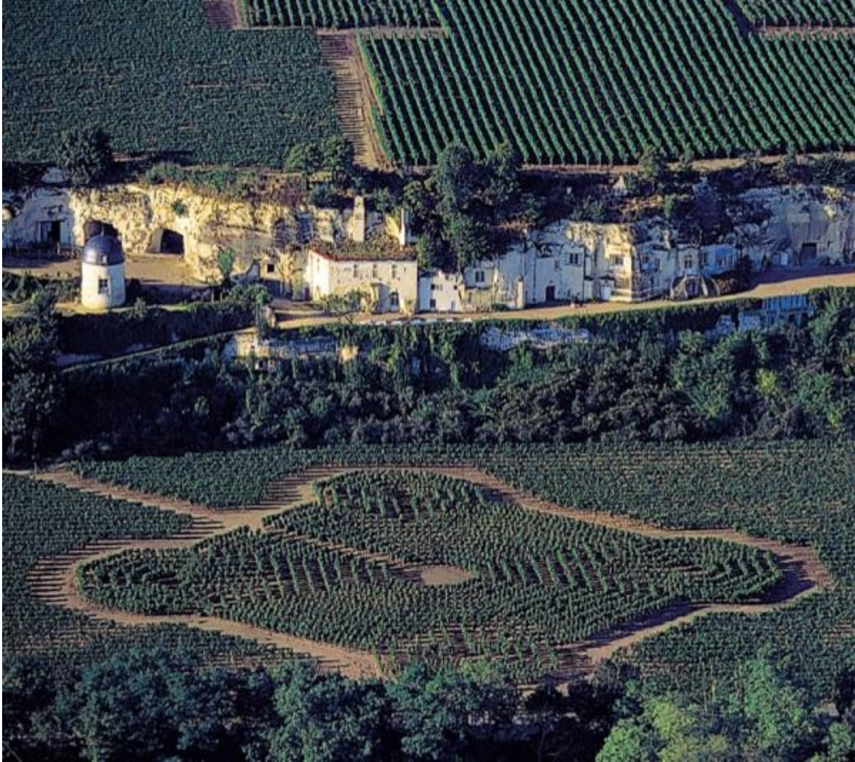
La Grande Vignolle.