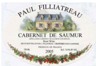
A.O.C Cabernet de Saumur