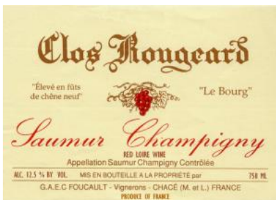
A.O.C Saumur-Champigny "Le Bourg"