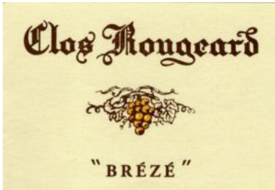
VdF "Brézé" Blanc