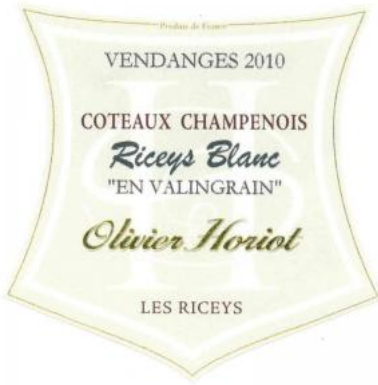
Coteaux Champenois Blanc " En Valingrain"