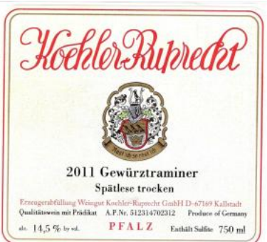
Gewürztraminer Kallstadter Steinacker Spätlese