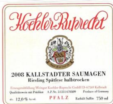
Kallstadter Saumagen Riesling Spätlese Halbtrocken