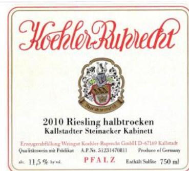
Riesling halbtrocken Kallstadter Steinacker Kabinett