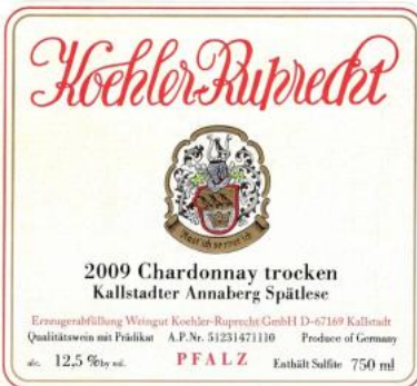
Chardonnay Trocken Kallstadter Spätlese