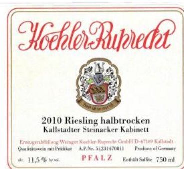
Riesling halbtrocken Kallstadter Steinacker Kabinett