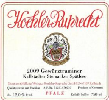
Gewürztraminer Kallstadter Steinacker Spätlese