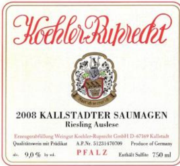
Kallstadter Saumagen Riesling Auslese