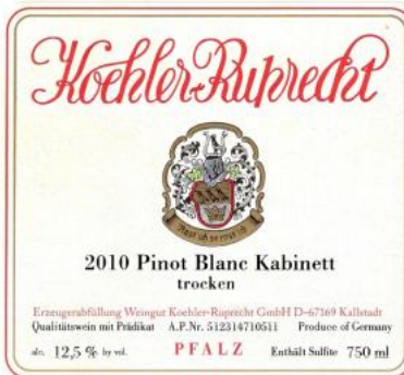
Pinot Blanc Kabinett trocken