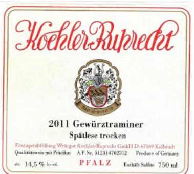
Gewürztraminer Kallstadter Steinacker Spätlese