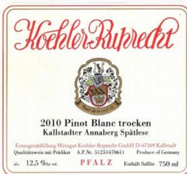
Pinot Blanc trocken Kallstadter Annaberg Spätlese