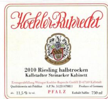
Riesling halbtrocken Kallstadter Steinacker Kabinett