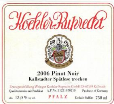
Pinot Noir Kallstadter Spätlese trocken