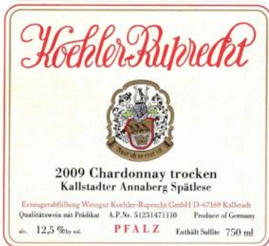
Chardonnay Trocken Kallstadter Spätlese