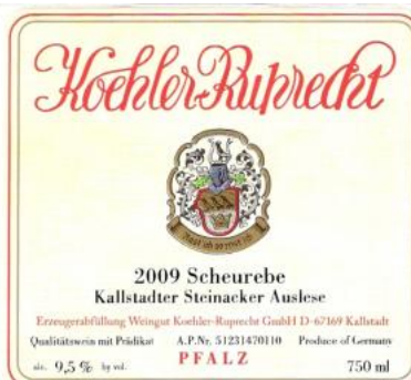
Scheurebe Kallstadter Steinacker Auslese