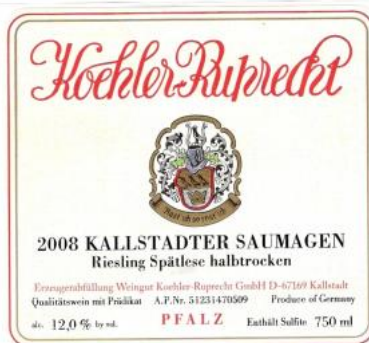
Kallstadter Saumagen Riesling Spätlese Halbtrocken