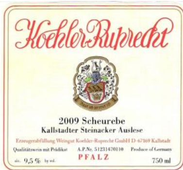
Scheurebe Kallstadter Steinacker Auslese