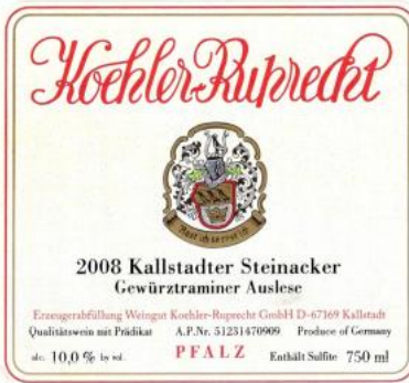
Kallstadter Steinacker Gewürztraminer Auslese