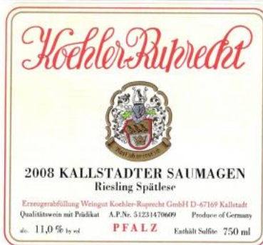
Kallstadter Saumagen Riesling Spätlese