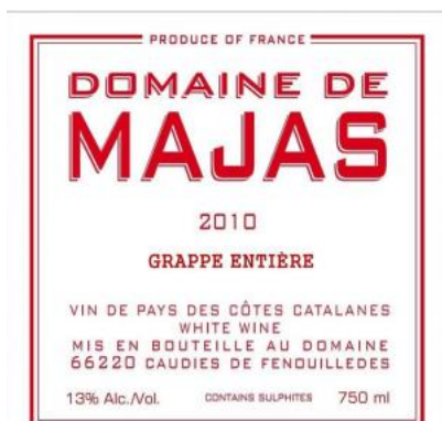
Vdp "Grappe Entière"

Vinification: fermented and aged in concrete on its lees.