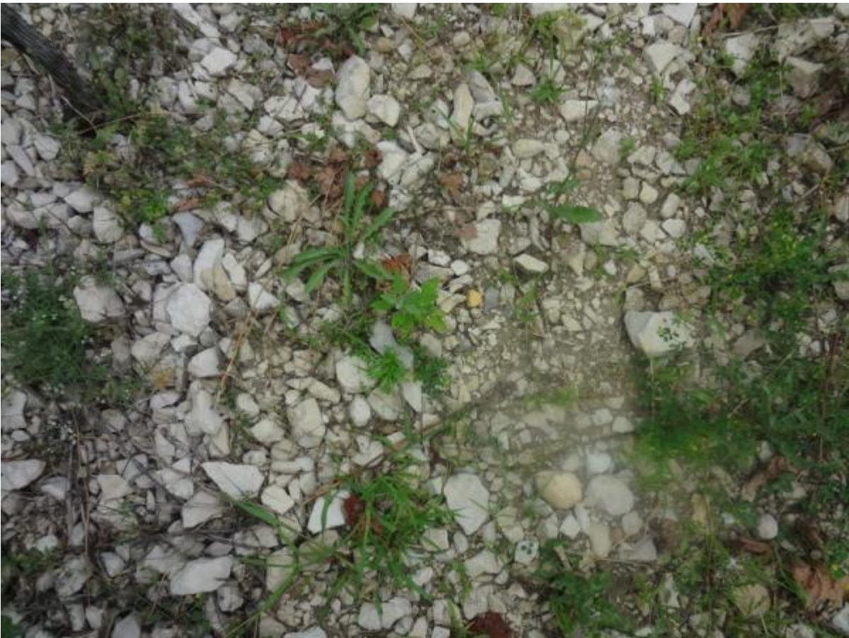
The chalk rocks you see are only on the surface, and are very close to what is used for commercial