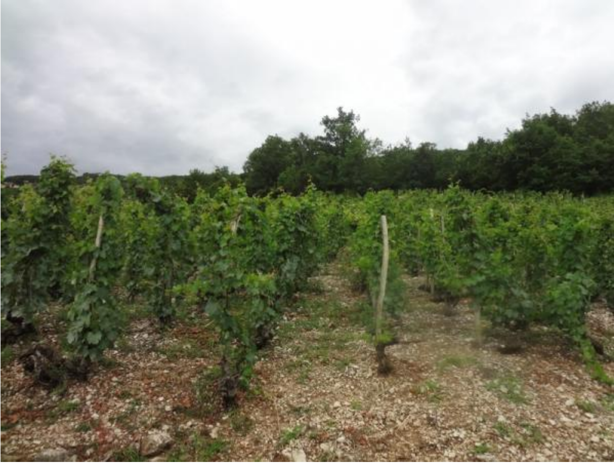
The vines we visited were on heavy clay.