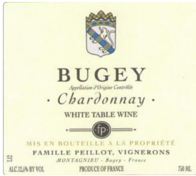
A.O.C Bugey "Chardonnay"