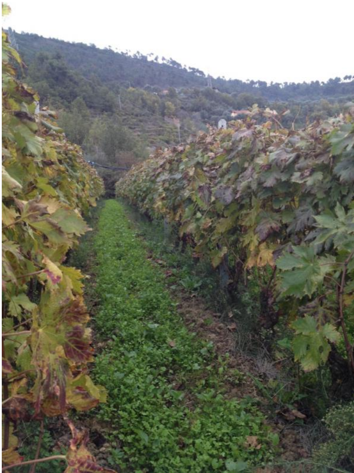
From the vineyards, you can spot the beginning of France.