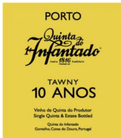
Tawny 10 Anos