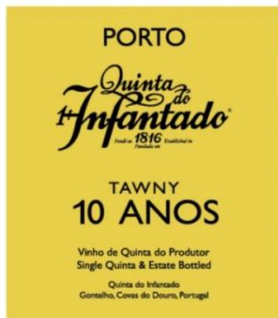
Tawny 10 Anos