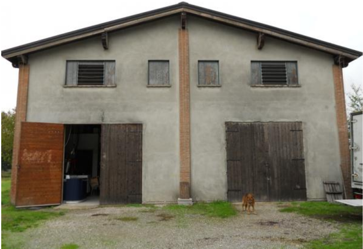
This is Luciano's completely home-made disgorge station.