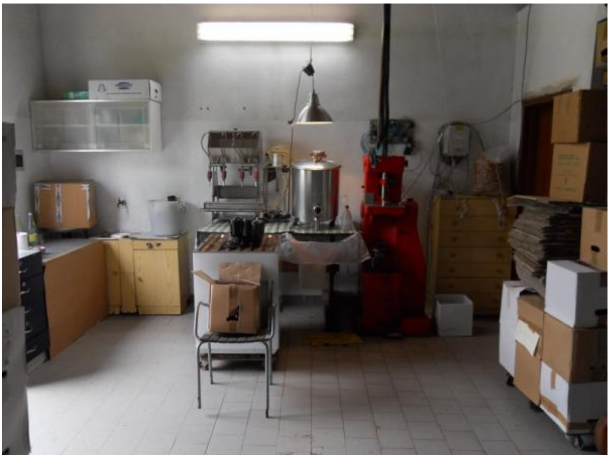
To give us a demonstration of the disgorging process (more on that later), Luciano grabbed some