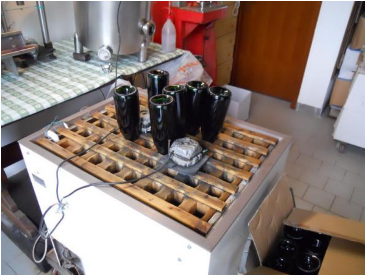
As those bottle tops started to freeze, Luciano showed us the rest of the cellar.