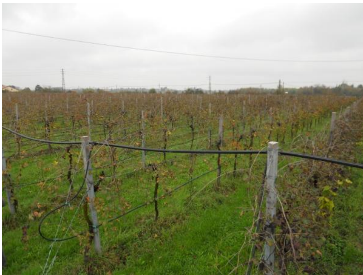
The oldest vines here are 50+ and planted every other row; Luciano replanted the rest in 1997. The soils are limestone with a clay subsoil.