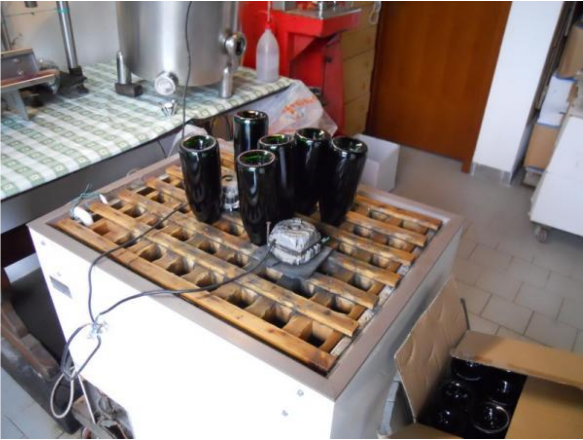
As those bottle tops started to freeze, Luciano showed us the rest of the cellar.