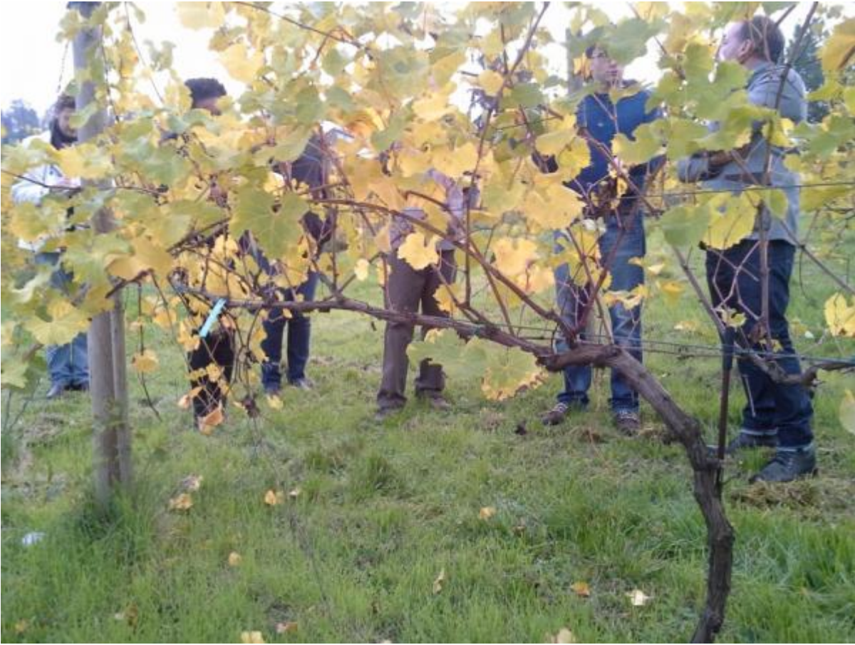
The fall colors of the leaves were beautiful, including some strikingly red plants.