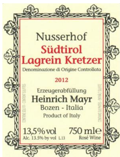
DOC Südtirol Lagrein Kretzker