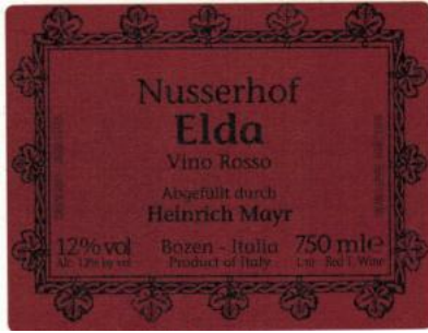
Vdt "Elda" Schiava