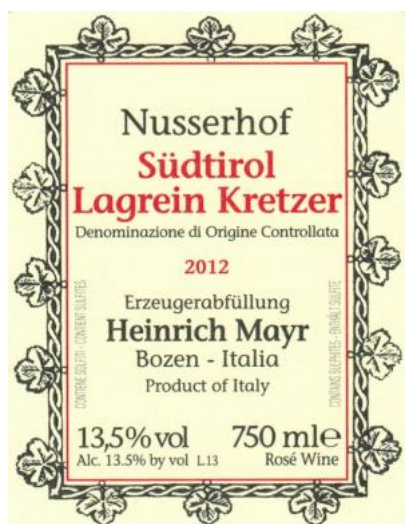
DOC Südtirol Lagrein Kretzer