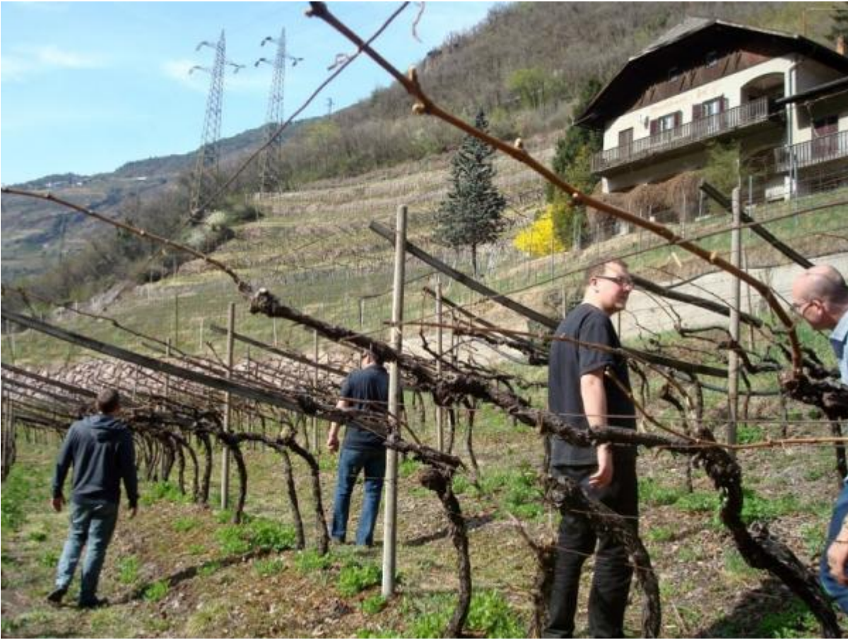
This vineyard is also right off the highway.