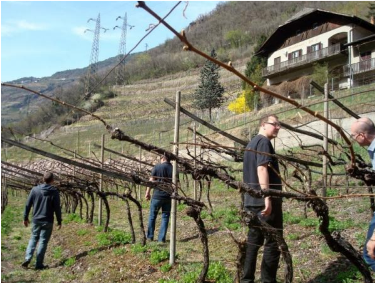
This vineyard is also right off the highway.