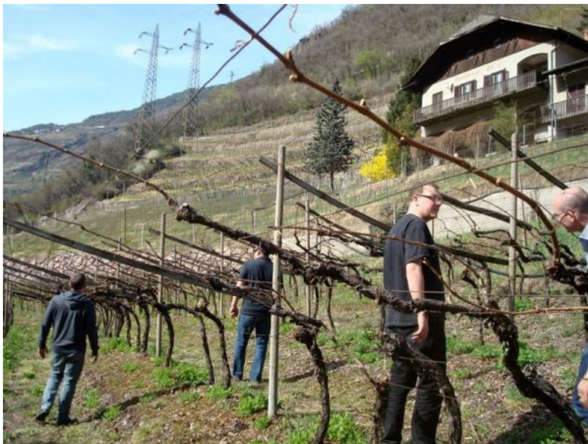
This vineyard is also right off the highway.