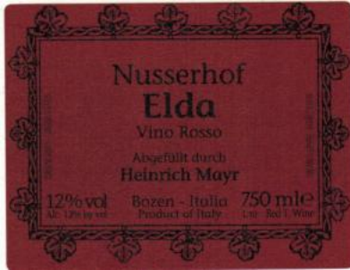
Vdt "Elda" Schiava