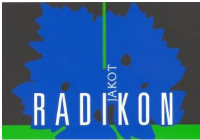
"Jakot" Grape: Tokaj

All whites are vinified the same way. After destemming, the grapes are put in oak vats, where they macerate on the skins without temperature control. Maceration continues until the sugars are exhausted (typically more than 30 days). The juice is then racked and left on the lees in 25 to 35 hl casks for about 36 months. Additional rackings occur if necessary.