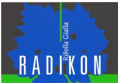
"Ribolla Gialla" Grape: Ribolla Gialla