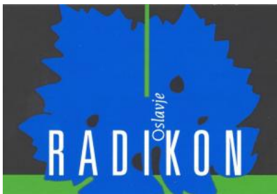
"Oslavje" Grapes: 30% Pinot Grigio, 40% Chardonnay, 30% Sauvignon Blanc