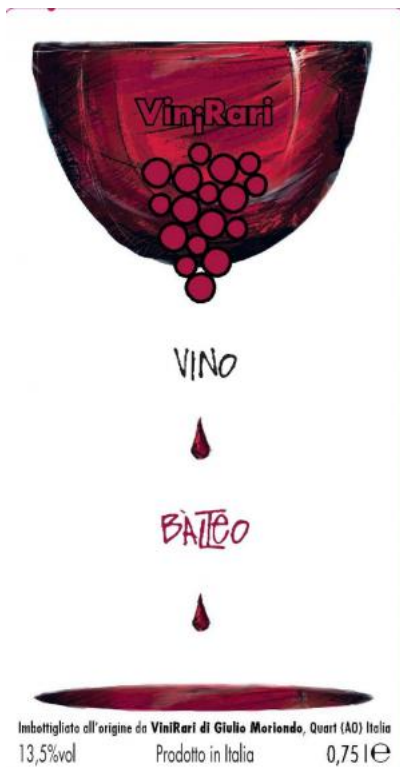
VdT Balteo: 85% fumin and 15% cornalin. Little known fact, cornalin in Aosta is not the same as cornalin in the Valais of Switzerland. It's what would be called humagne rouge in Switzerland, a descendent of Swiss cornalin. However, Swiss cornalin is descended from petit rouge and vien de nus from Aosta.